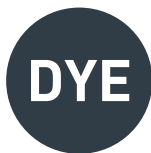
DYE SUB TRANSFER